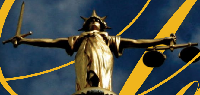
The Statue of Justice, depicted as a woman with a sword in one hand and scale in her other, is seen on top of the London Central Criminal Court, the Old Bailey in London .